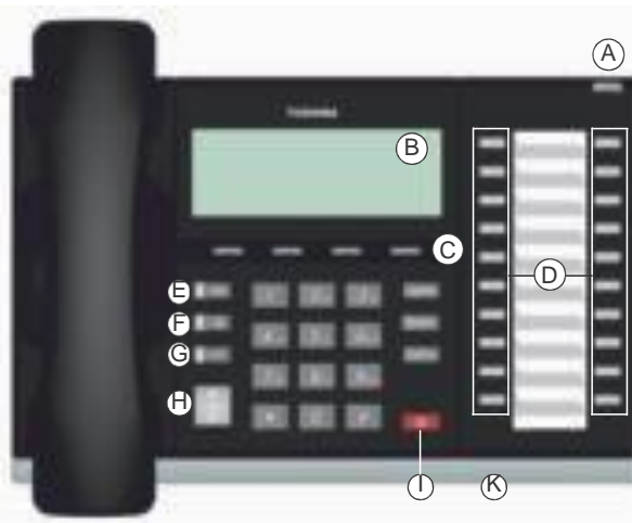
20 Programmable Feature Buttons 4-Line LCD