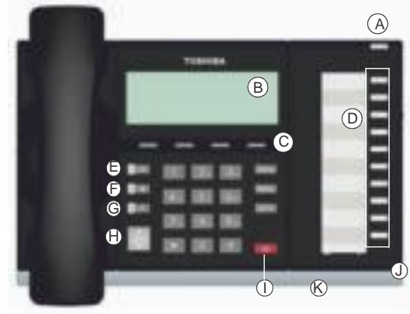
10 Programmable Feature Buttons 4-Line LCD